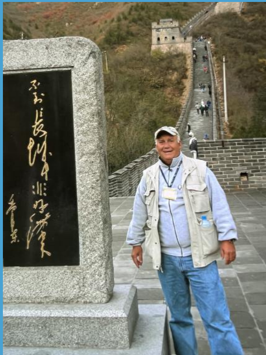
Visiting the Great Wall of China