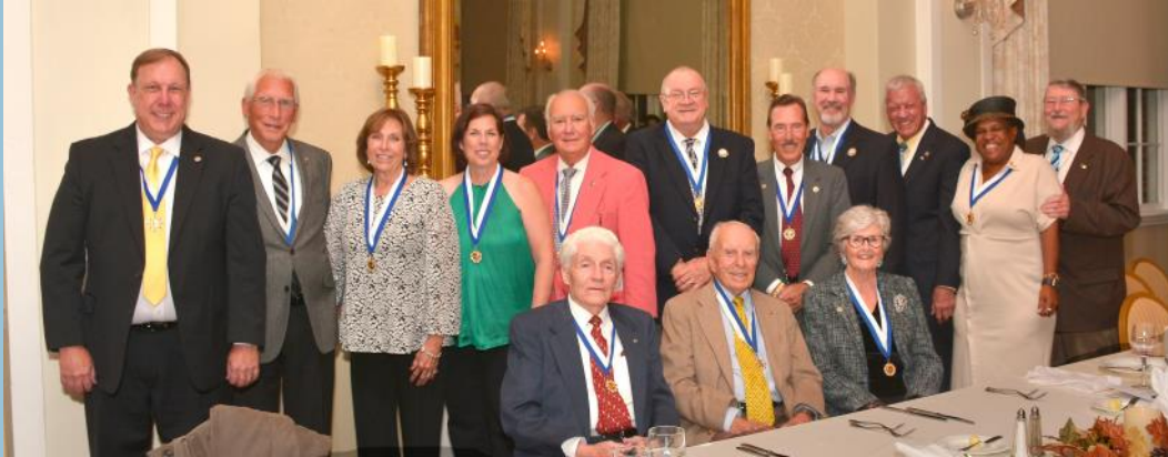
Members present that have been honored with a Hixson Fellowship award