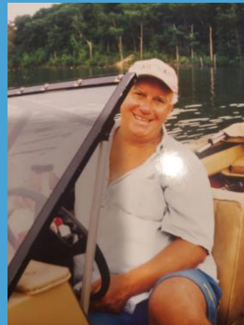
Enjoying time on Lake Holliday

Kiwanis Club of Winchester is successful because of its many volunteer members who give so freely of their time and effort.