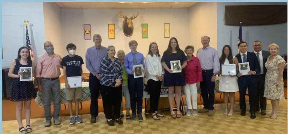
Scholarship winners and their parents