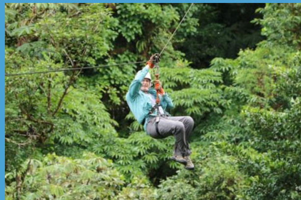
Vacationing in Costa Rica on the Rio Celeste River and zip lining in the Monteverde Region