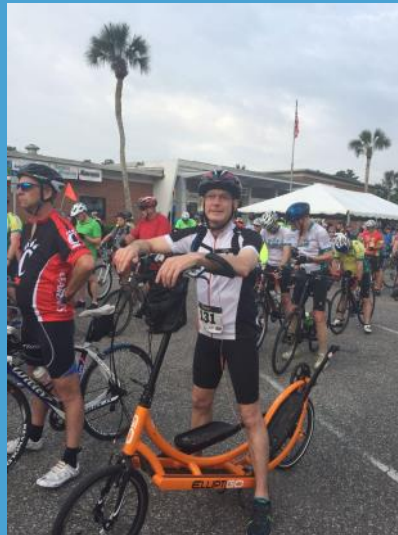
On his EliptoGO bike before the Katie Ride in Amelia Island, FL