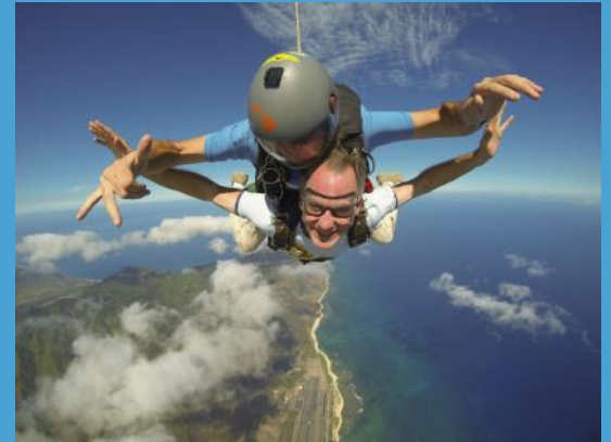
Skydiving in Hawaii