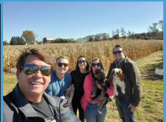
Going through the corn maze at West Oaks Market has become a family tradition since they opened.